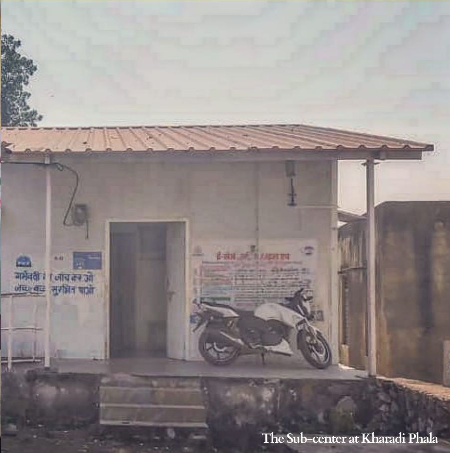
The Sub-center at Kharadi Phala