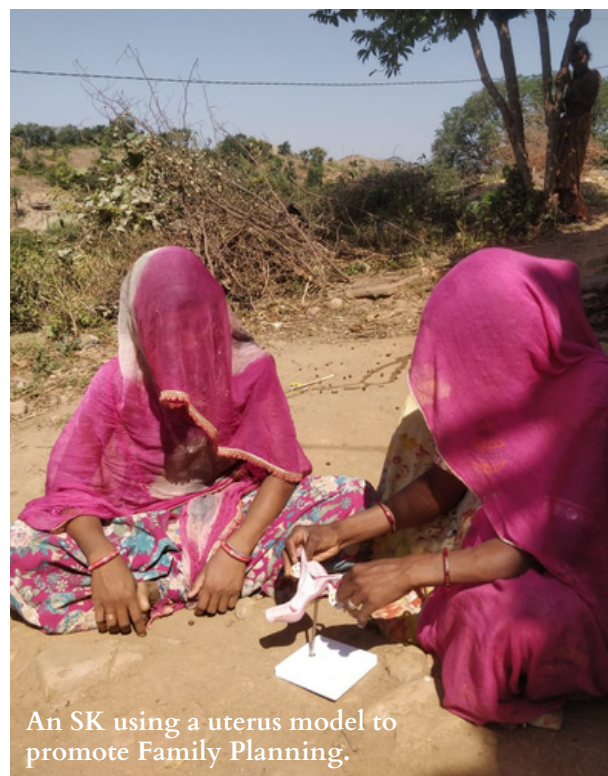
An SK using a uterus model to promote Family Planning.