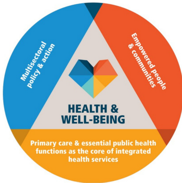
Fig. 1: Conceptual Framework of Primary Health Care.