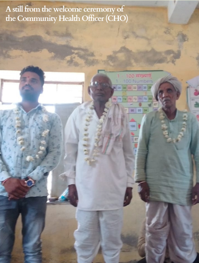
A still from the welcome ceremony of the Community Health Officer (CHO)