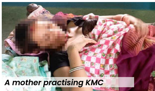
A mother practising KMC