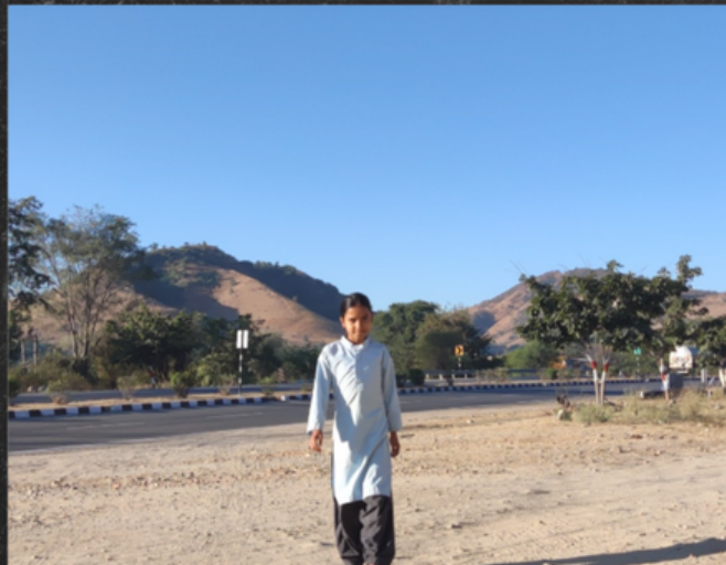
Sincere gratitude to KC Patty for designing and sharing this curriculum.