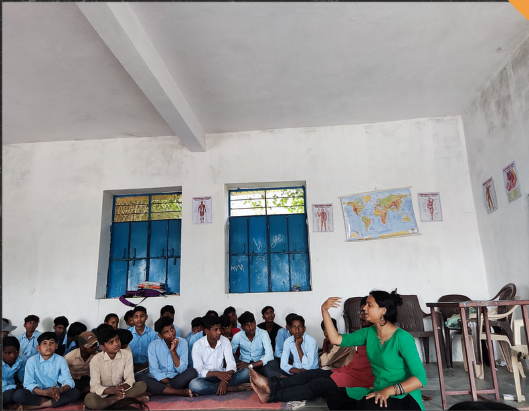
A school health session in progress. Rawach.